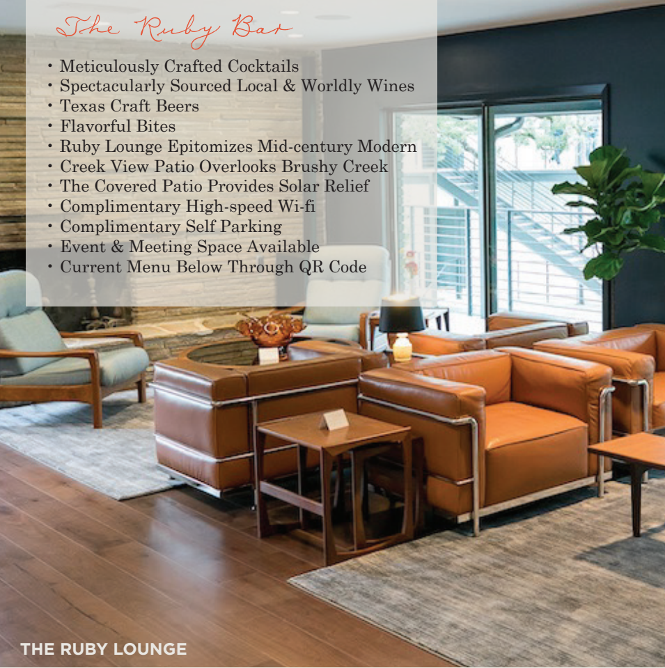
THE RUBY LOUNGE